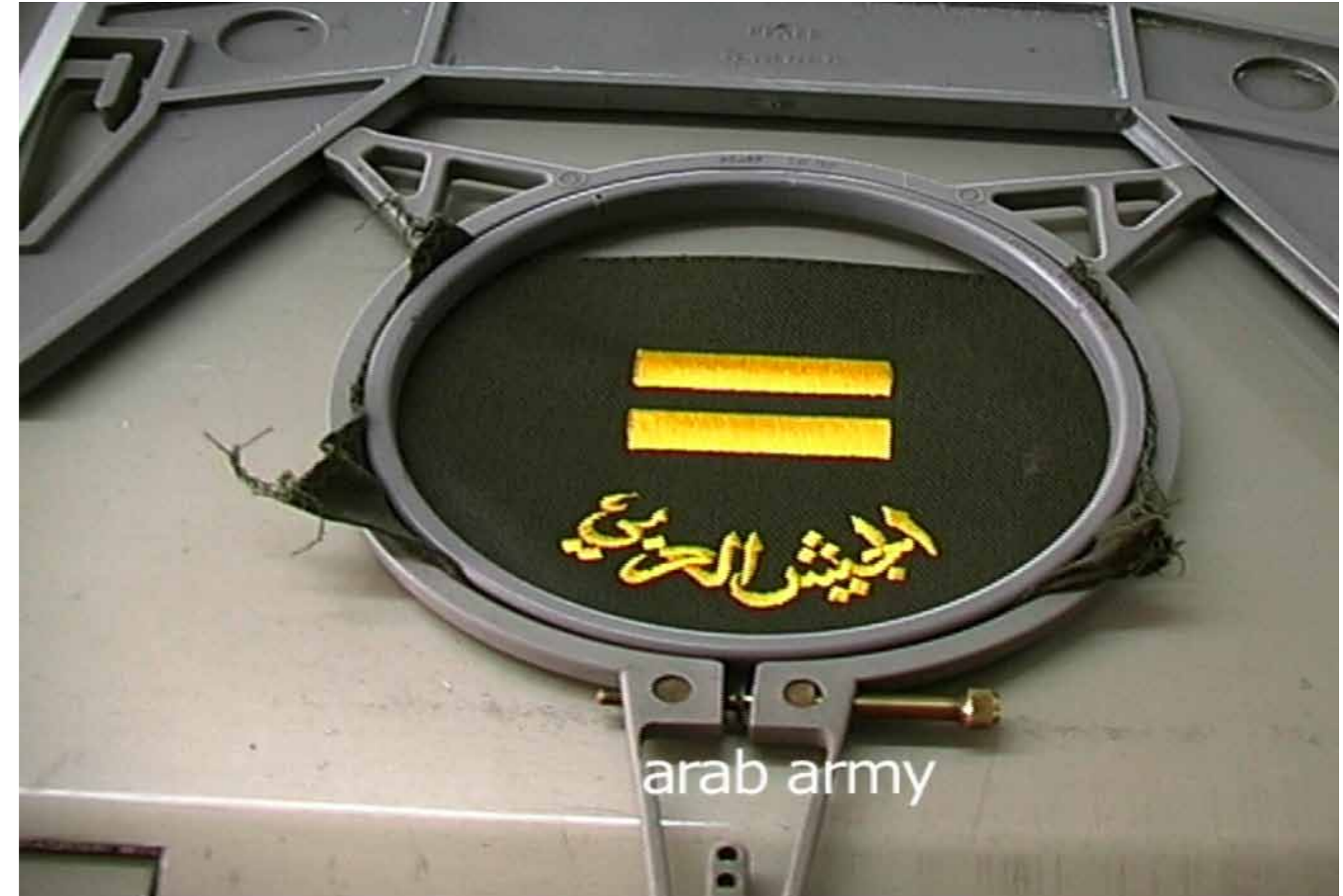
Arab Army, video still